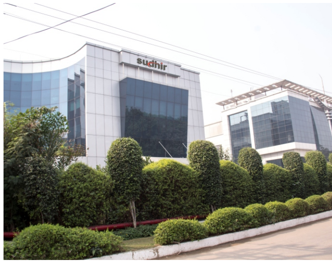
Corporate Office, Gurgaon