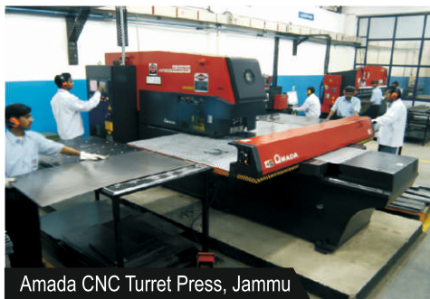
Amada CNC Turret Press, Jammu

Our promptness, efficiency and world class technology is our hallmark shared by the after sales team. Reason why, we have one of the largest repeat-order customer base.