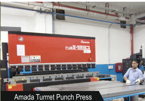
Amada Turret Punch Press