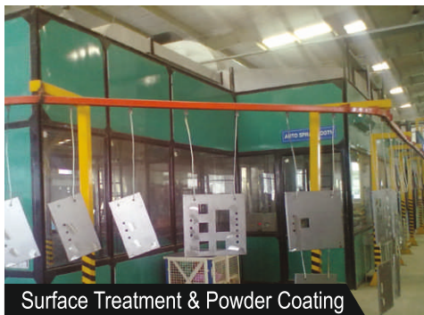
Surface Treatment & Powder Coating