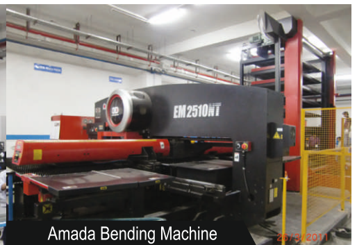
Amada Bending Machine