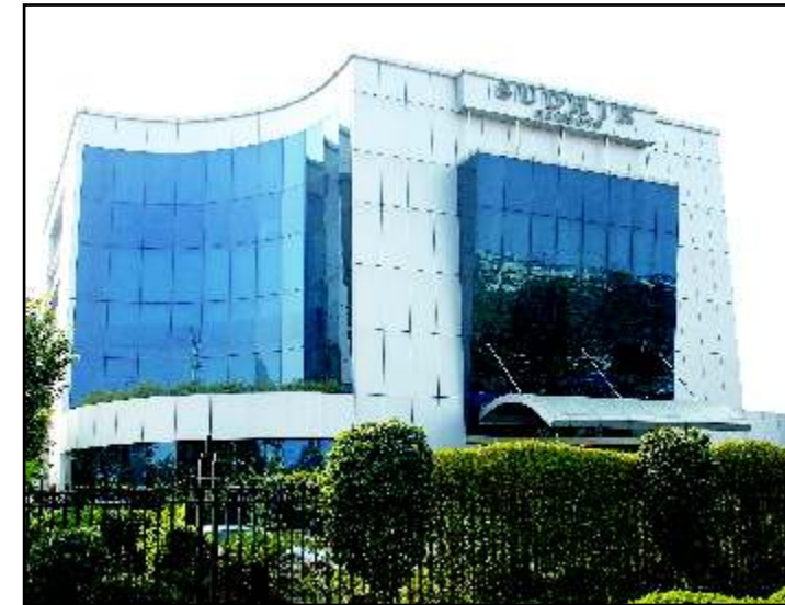
Corporate Office, Gurgaon