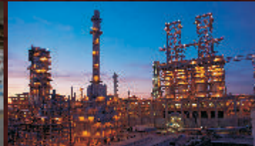
Sudhir-Electrical Power Contracts