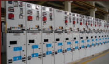
Sudhir-Schneider HT Panels