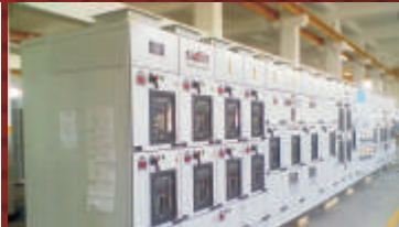
Sudhir-Schneider LT Panels