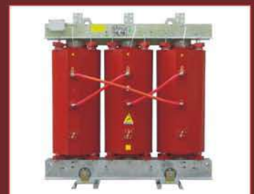
Sudhir - Tesar Transformers