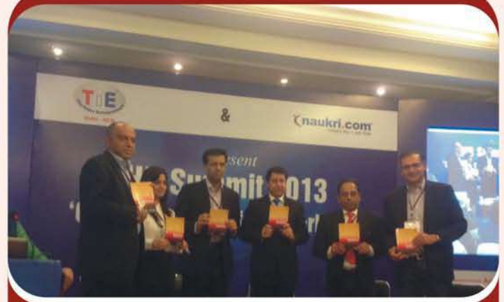
Book Launch - Maverick Minds