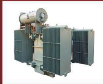
Sudhir - Oil Transformers