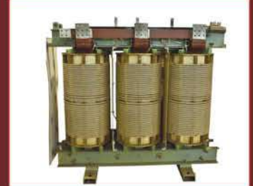
Sudhir - Dupont Transformers