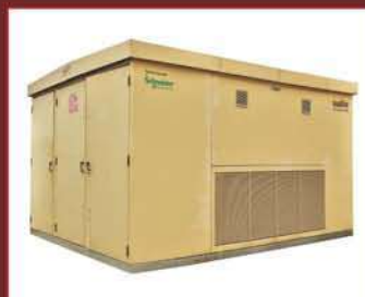
Sudhir - Schneider Substations