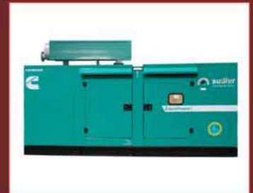
Sudhir - Cummins Gensets

We, at Sudhir, are the industry leader in the Indian power sector. For around four decades, we have been broadening the horizons of infinite opportunities.