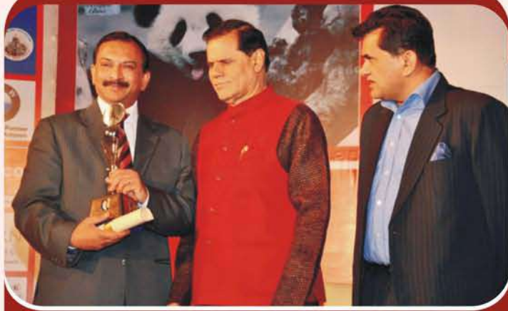
Sudhir Country Inn and Suites Awarded the Best Corporate Boutique Hotel in Gurgaon

Sudhir Country Inn & Suites has been awarded, the best Corporate Boutique Hotel in Gurgaon at the 9th Hospitality India awards for the 2 nd year running. The awards were given in New Delhi on 11 th October, 2013 at Hotel Ashok.