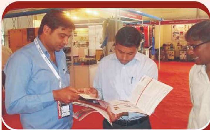
Indus-Tech Industrial Expo 2013

Powerbox 6000 offers a cost effective alternative to constructing an on-site substation. Pre manufactured and ready to use containerized transformers that are ready to use for applications from power plants to construction sites.