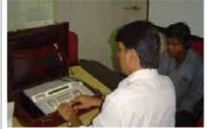
Audiometric Tests Training, Masat