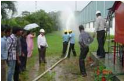
Fire Hydrant Training, Athal