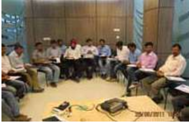
Project Management Training, Manesar