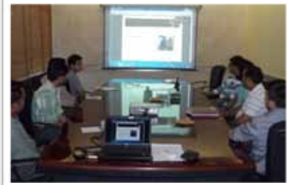
Training on Executive Skills, Jammu