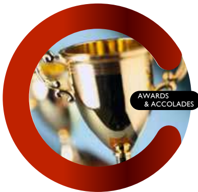
AWARDS & ACCOLADES