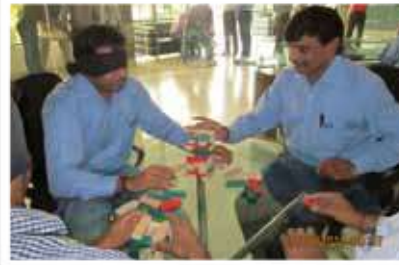
Training on Teamwork, Gurgaon