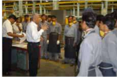
Safety Awareness Training, Athal