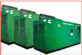
Sudhir - Cummins Gensets