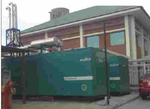
MAX HOSPITAL, MOHALI