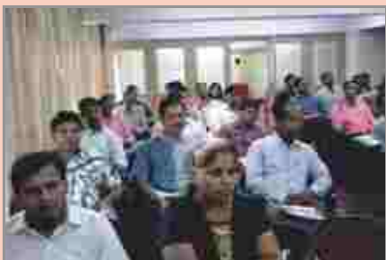
Positive Attitude & Motivational Discipline, Sudhir-Silvassa Plant, near Mumbai

To maintain a learning culture in our business, we keep arranging training programs at our manufacturing units and offices spread across India to hone our employee skills. Glimpses of the training programs conducted at various places can be seen below.