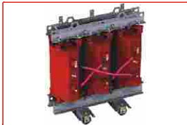
Sudhir - Tesar Transformers