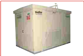
Sudhir - Schneider Substation